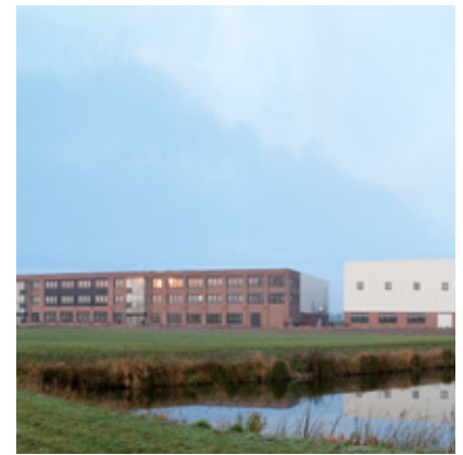
Germany, Plant 3 (FAMAC®): Pöppelmann GmbH & Co. KG, Lohne

Our Pöppelmann FAMAC® business division develops and manufactures technical functional components and packagings for the food, pharmaceutical, cosmetics and medical industry. To this end, the introduction and implementation of a quality management pursuant to DIN EN ISO 9001:2008 and of a hygiene management system in accordance with the Codex Alimentarius has been certified by an independent institute.