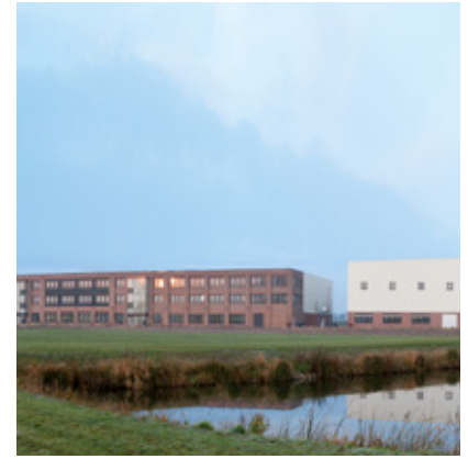
Germany, Plant 3 (FAMAC®): Pöppelmann GmbH & Co. KG, Lohne

Our Pöppelmann FAMAC® business division develops and manufactures technical functional components and packagings for the food, pharmaceutical, cosmetics and medical industry. To this end, the introduction and implementation of a quality management pursuant to DIN EN ISO 9001:2008 and of a hygiene management system in accordance with the Codex Alimentarius has been certified by an independent institute.