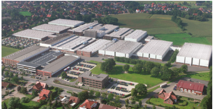
Germany, Plant 1: Pöppelmann GmbH & Co. KG, Kunststoffwerk-Werkzeugbau, Lohne

Our Pöppelmann FAMAC® business division develops and manufactures technical functional components and packagings for the food, pharmaceutical, cosmetics and medical industry. To this end, the introduction and implementation of a quality management pursuant to DIN EN ISO 9001:2008 and of a hygiene management system in accordance with the Codex Alimentarius has been certified by an independent institute.