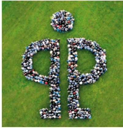
More than 1,900 Pöppelmann employees stand for productivity, quality and service.

Pöppelmann – a strong and reliable partner. Since 1949 the family-owned company Pöppelmann with 5 production sites and 550 injection moulding, thermoforming machines and extruders has proved itself to be a leading manufacturer in the plastic processing industry. In more than 90 countries the quality “made by Pöppelmann” is appreciated. More than 1,900 highly qualified employees stand for our success.