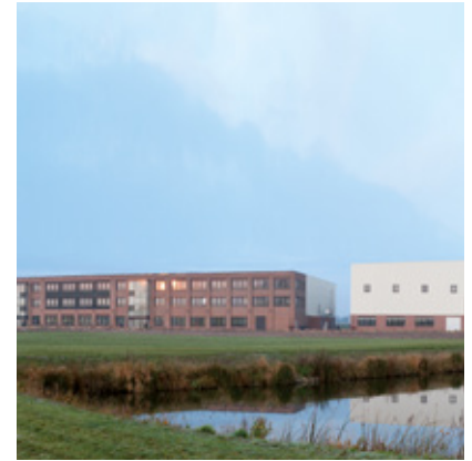
Germany, Plant 3 (FAMAC®): Pöppelmann GmbH & Co. KG, Lohne

Our Pöppelmann FAMAC® business division develops and manufactures technical functional components and packagings for the food, pharmaceutical, cosmetics and medical industry. To this end, the introduction and implementation of a quality management pursuant to DIN EN ISO 9001:2008 and of a hygiene management system in accordance with the Codex Alimentarius has been certified by an independent institute.