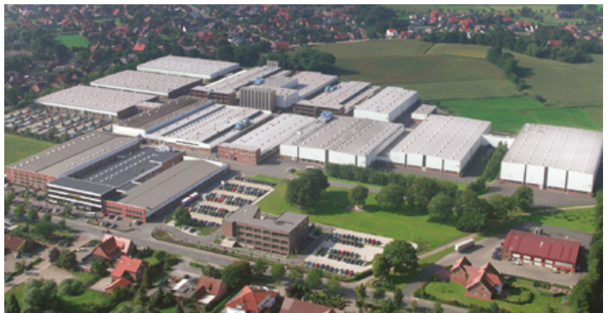
Germany, Plant 1: Pöppelmann GmbH & Co. KG, Kunststoffwerk-Werkzeugbau, Lohne

Our Pöppelmann FAMAC® business division develops and manufactures technical functional components and packagings for the food, pharmaceutical, cosmetics and medical industry. To this end, the introduction and implementation of a quality management pursuant to DIN EN ISO 9001:2008 and of a hygiene management system in accordance with the Codex Alimentarius has been certified by an independent institute.