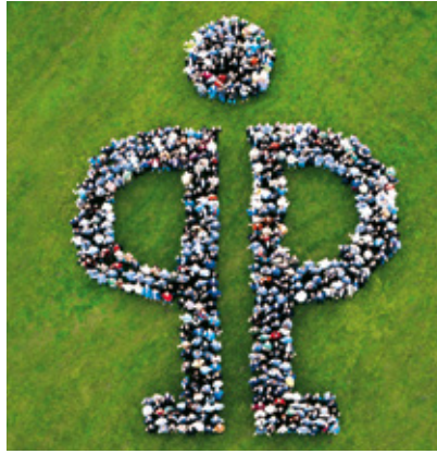
The “Pöppelmänner and Pöppelfrauen”: They stand for productivity, quality and service.

Pöppelmann – a strong and reliable partner. Since 1949 the family-owned company Pöppelmann with 5 production sites and 600 injection moulding, thermoforming machines and extruders has proved itself to be a leading manufacturer in the plastic processing industry. In more than 90 countries the quality “made by Pöppelmann” is appreciated. More than 2,500 highly qualified employees worldwide stand for our success.