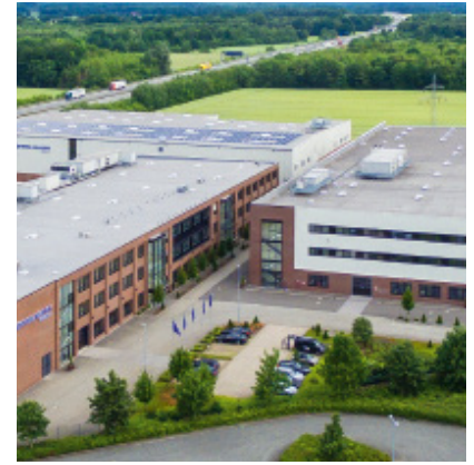
Deutschland, Plant 3 (FAMAC®): Pöppelmann GmbH & Co. KG, Lohne.

Our Pöppelmann FAMAC® business division develops and manufactures technical functional components and packagings for the food, pharmaceutical, cosmetics and medical industry. To this end, the introduction and application of a quality and hygiene management system in accordance with the BRC Global Standard for Packaging and Packaging Materials (version 5: July 2015, category “High Hygiene Risk”) and DIN EN ISO 13485 as a quality management system for the development and manufacturing of medical products was certified by an independent institutes.