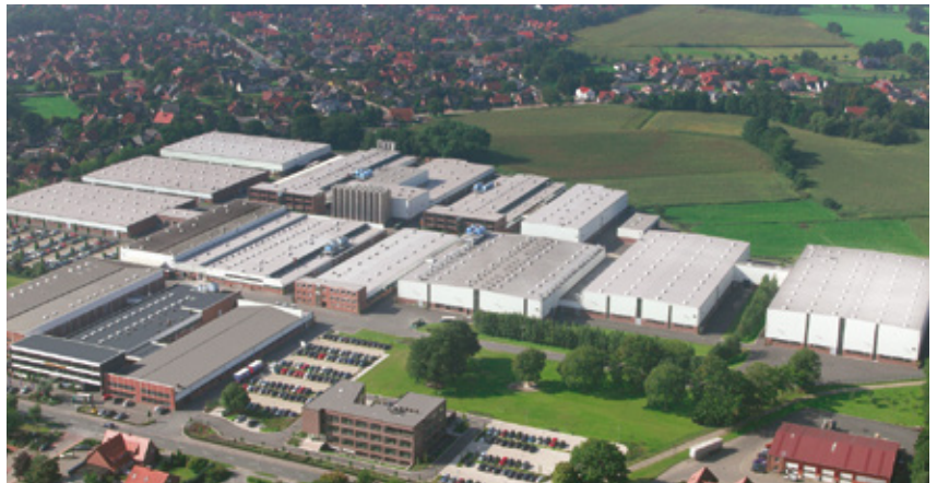
Germany, Plant 1: Pöppelmann GmbH & Co. KG, Kunststoffwerk-Werkzeugbau, Lohne

Our Pöppelmann FAMAC® business division develops and manufactures technical functional components and packagings for the food, pharmaceutical, cosmetics and medical industry. To this end, the introduction and application of a quality and hygiene management system in accordance with the BRC Global Standard for Packaging and Packaging Materials (version 5: July 2015, category “High Hygiene Risk”) and DIN EN ISO 13485 as a quality management system for the development and manufacturing of medical products was certified by an independent institutes.