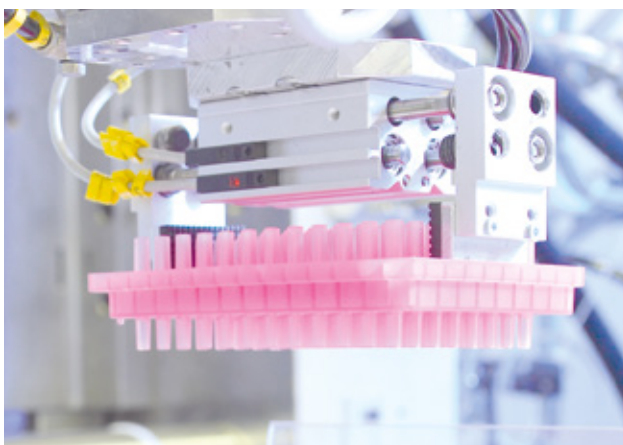
Fully automatic handling system

Clean air is supplied to the tool area via suspended particle filters. After demoulding, the good parts drop onto a fully enclosed conveyor belt suitable for use in cleanrooms. Optionally, a handling robot may be used to demould complex or sensitive parts and to place them on the conveyor belt.