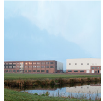
Germany, Plant 3 (FAMAC®): Pöppelmann GmbH & Co. KG, Lohne

Our Pöppelmann FAMAC® business division develops and manufactures technical functional components and packagings for the food, pharmaceutical, cosmetics and medical industry. To this end, the introduction and implementation of a quality management pursuant to DIN EN ISO 9001:2008 and of a hygiene management system in accordance with the Codex Alimentarius has been certified by an independent institute.