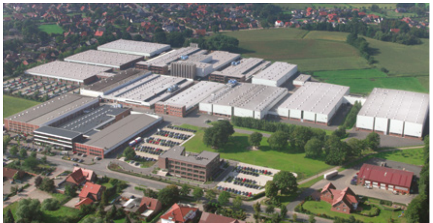
Germany, Plant 1: Pöppelmann GmbH & Co. KG, Kunststoffwerk-Werkzeugbau, Lohne

Our Pöppelmann FAMAC® business division develops and manufactures technical functional components and packagings for the food, pharmaceutical, cosmetics and medical industry. To this end, the introduction and implementation of a quality management pursuant to DIN EN ISO 9001:2008 and of a hygiene management system in accordance with the Codex Alimentarius has been certified by an independent institute.